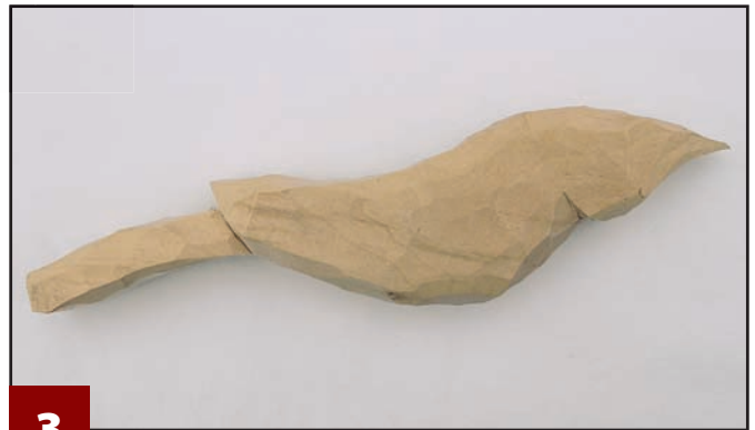
3 Define the major landmarks. Make a stop cut at the wing area and at the head. Taper the tail and the beak.