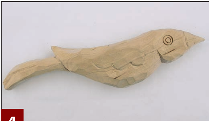
4 Add the final details. Outline the scalloped wings and the beak with a V-tool. Groove the wing-tips and the tail with a V-tool. Set the eyes with an eye punch. Paint the bird with acrylic paints and seal it with tung oil.