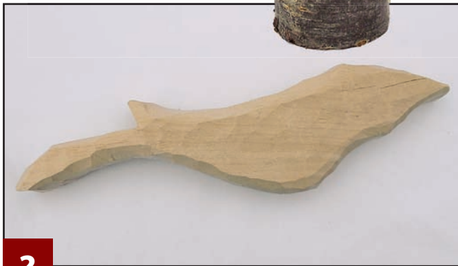
2 Rough shape the bird. Carve away the band saw marks and round all the edges with a bench knife.